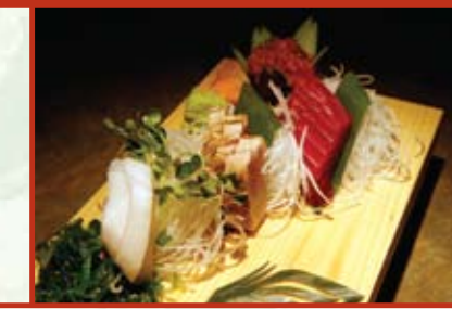
Tuna Sashimi 3 pcs. Red Tuna, 2 pcs. White Tuna 3 pcs. Tataki Tuna $12