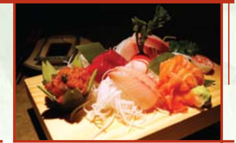
Combination 2 pcs. each, Tuna, Salmon, Whitefish & Yellow Tail $12

Substitutions subject to additional charge (Parties of six or more will be charged 18% gratuity) *Consuming raw or undercooked meats, poultry, seafood, shellfish or eggs may increase your risk of food borne illness, especially if you have certain medical conditions.