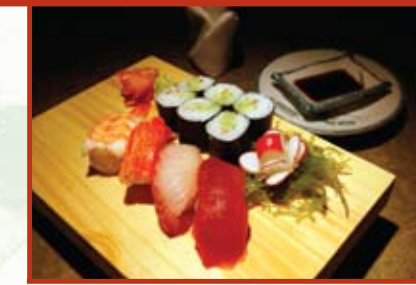
Sushi A 4 pcs. Sushi & Cucumber Roll $9.00