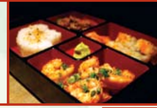
Bento C Teriyaki Shrimp $9.50