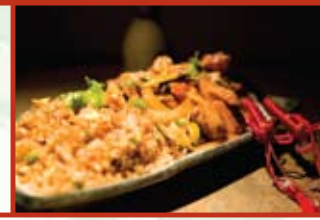
Spicy Chicken with Fried Rice $9.00