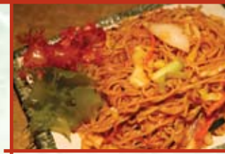
Yaki Soba Stir Fried Egg Noodle with Vegetable $9.00