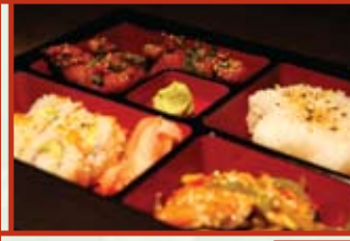
Bento A Teriyaki Chicken $8.50

4 pc. California Roll, Stir Fried Vegetable & Steamed Rice, Substitute Fried Rice $2