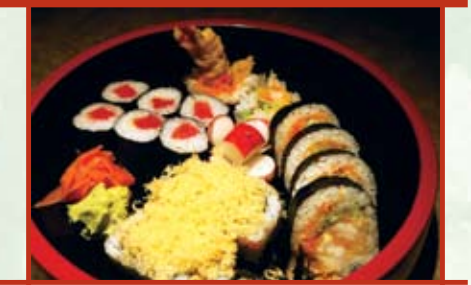
Maki B Shrimp Tempura, Tuna & Crunch Roll $10.50