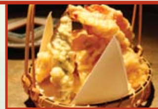
Shrimp & Veggie $8.00