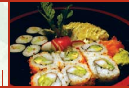
Maki A California, Cucumber & Crunch Roll $9.50