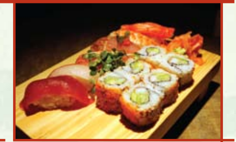
Sushi B 6 pcs. Sushi & California Roll $11.00