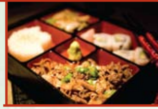
Bento B Teriyaki Beef $9.50