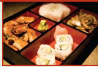
Bento D Ton Katsu $9.95