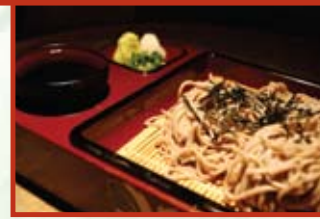
Soba Cold Buckwheat Noodle $8.00