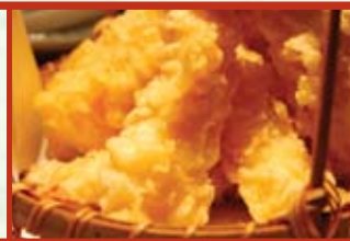
Shrimp Tempura 6 pcs. $9.00