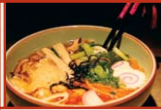
Udon Thick Noodle in Hot Broth $9.00