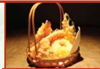
Vegetable Tempura $7.50